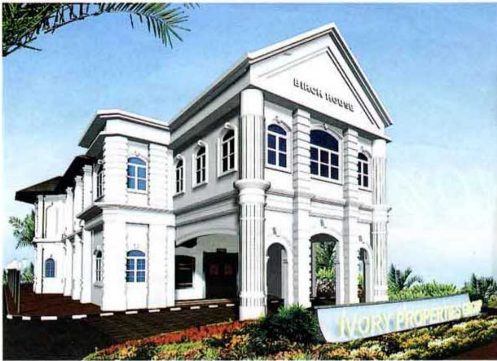
The Ivory corporate team works out of the colonial Birch House.