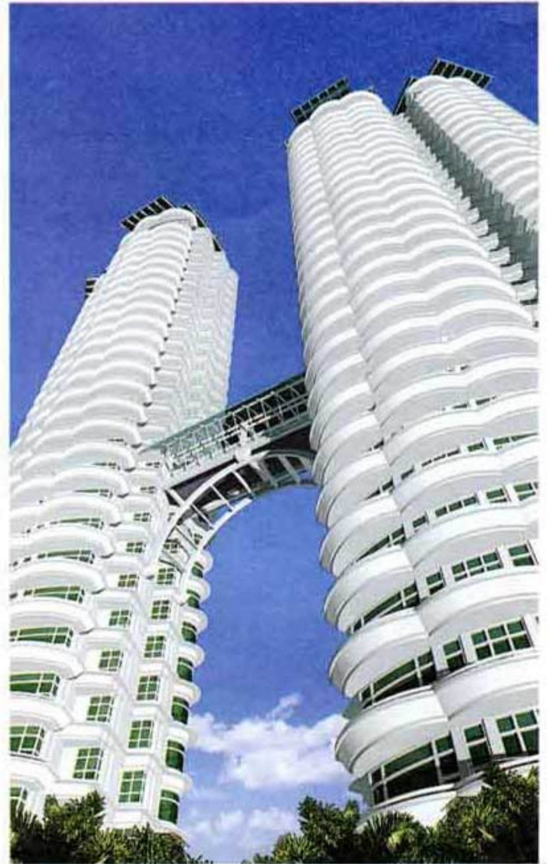
The Twin Towers on Jalan Sultan Azlan Shah is another Ivory project.