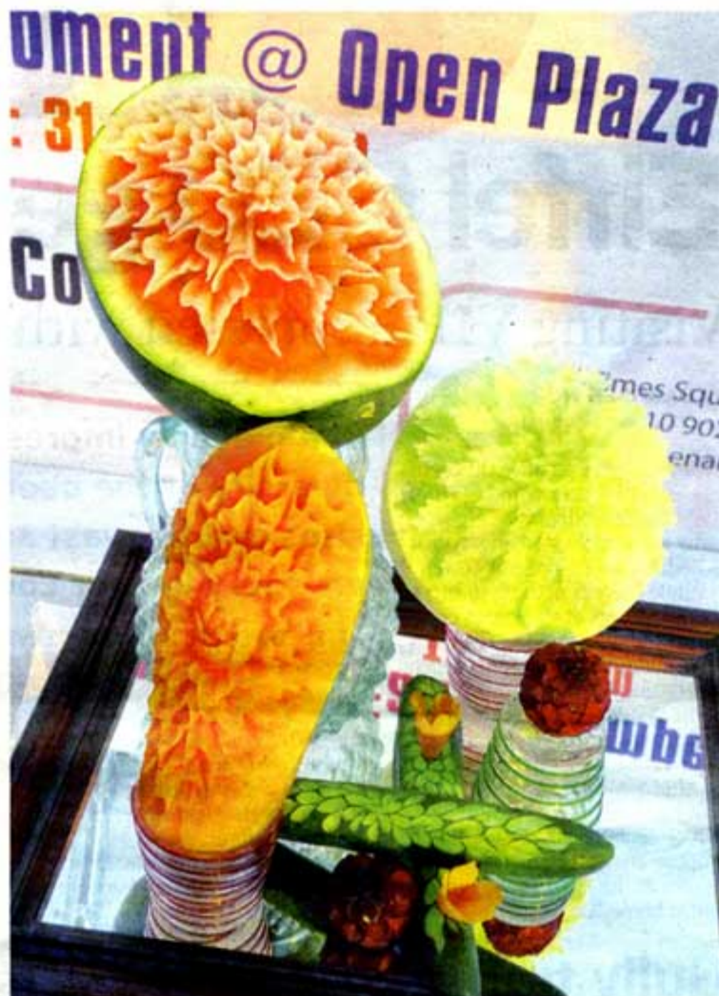
Top-notch: Mohd Sahar's Crystal Vegetables (above), which emerged winner in the Fruit and Vegetable Carving Competition.